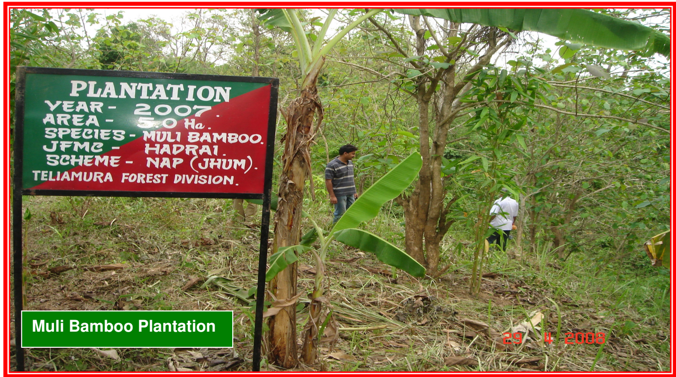
Evaluation undertaken by

Report on <u>First Concurrent Evaluation of</u> Projects under NAP Scheme Being implemented through <u>Forest Development Agency (FDA),</u> <u>Telimura (Jhum), West Tripura,</u> <u>Tripura State</u> (North Eastern Region), India